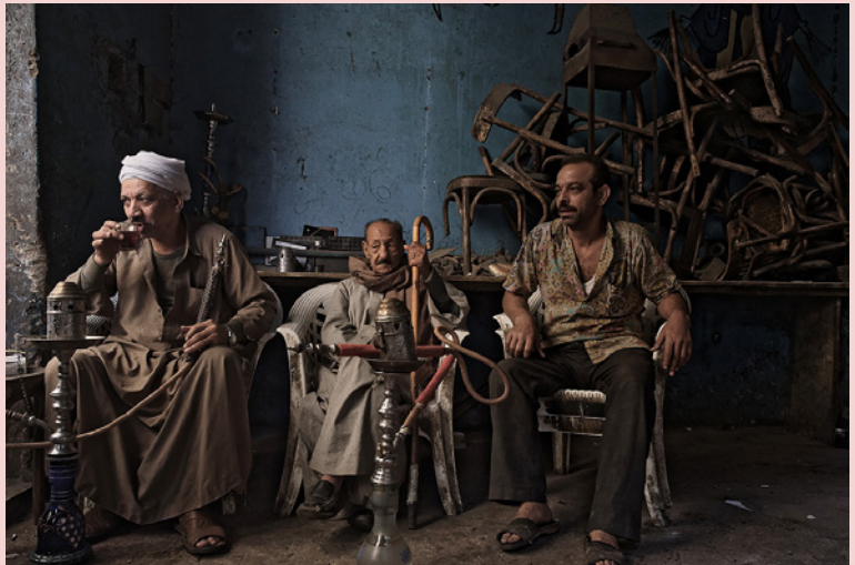
Trois mages au Caire, Egypte