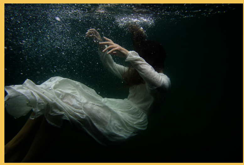
© Marie Wengler, Screaming Silently-Silently Screaming, Untitled , 2022