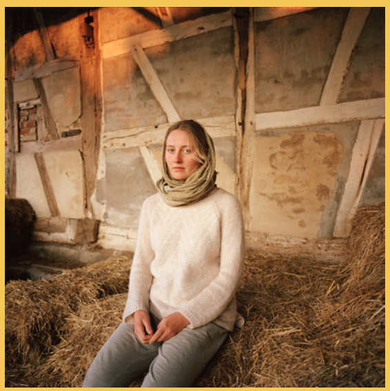
© Cloé Harent, Wwoofeuse, Saône-et-Loire, 2019