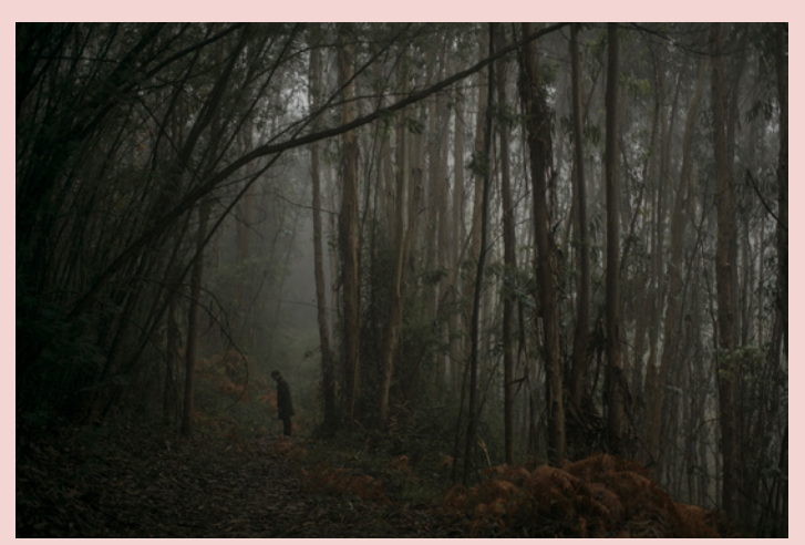
Os Batismos da Meia Noite